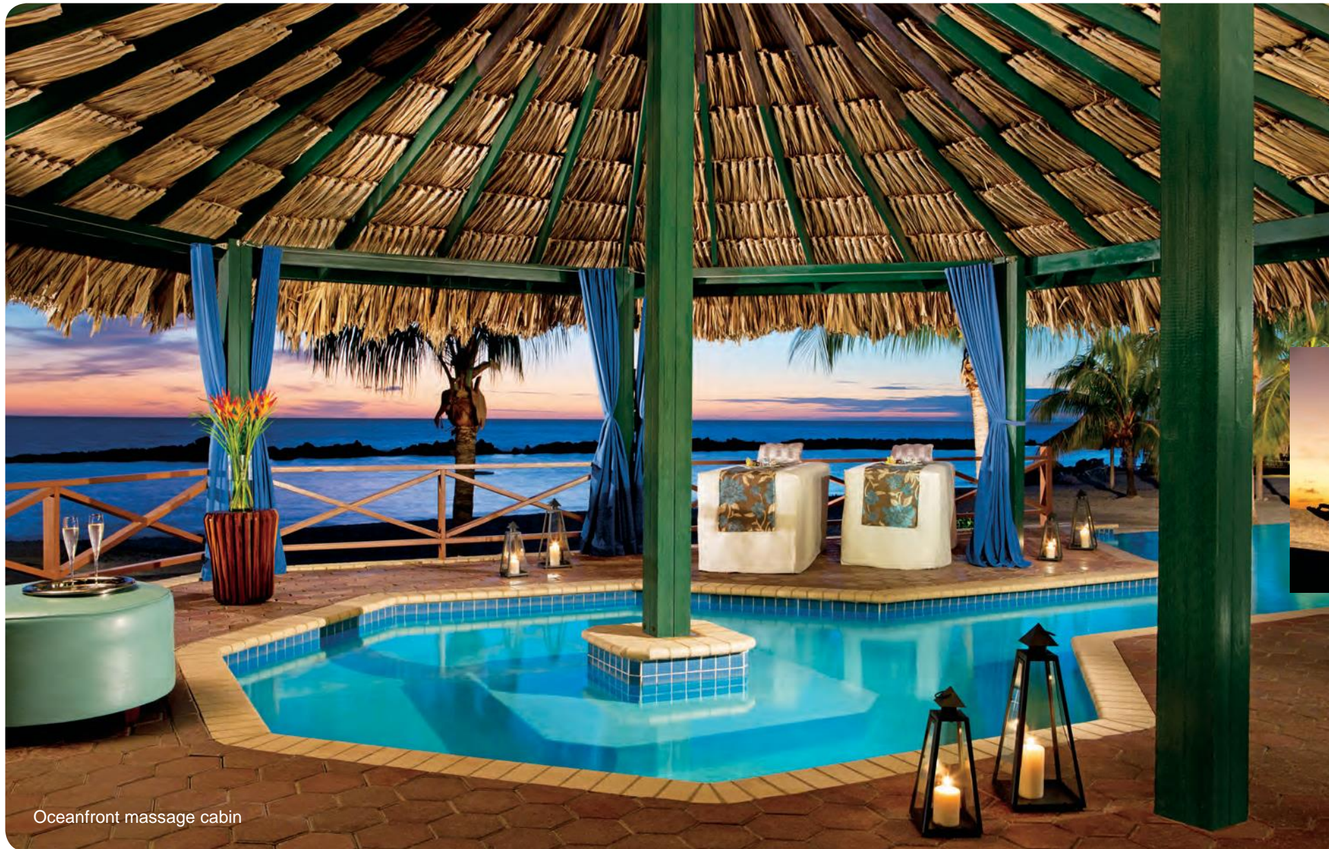
Oceanfront massage cabin

WARM SWIRLING WATERS, TENSION MELTING STEAM, A COUPLES MASSAGE BY THE SEA — YOU'VE BEEN GENTLY TRANSPORTED TO HEAVEN.